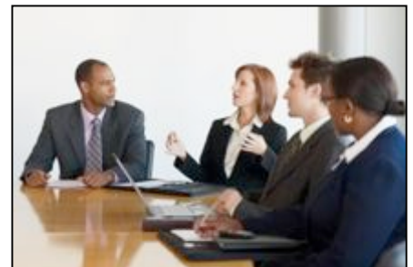
Business Courses - ICB