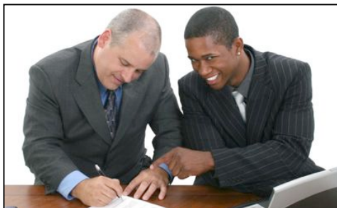
Business Courses - SAIM

Course prices subject to change. Confirm price on booking.